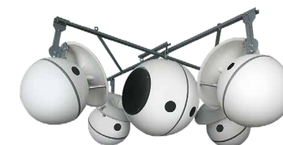
Model Q-Combo 5

Q-12A Combo 5 (shown): Includes 4 Model Q-12A loudspeakers, 1 Q-SB2 subwoofer, BK5 Boom Kit, and a QCX electronic crossover.